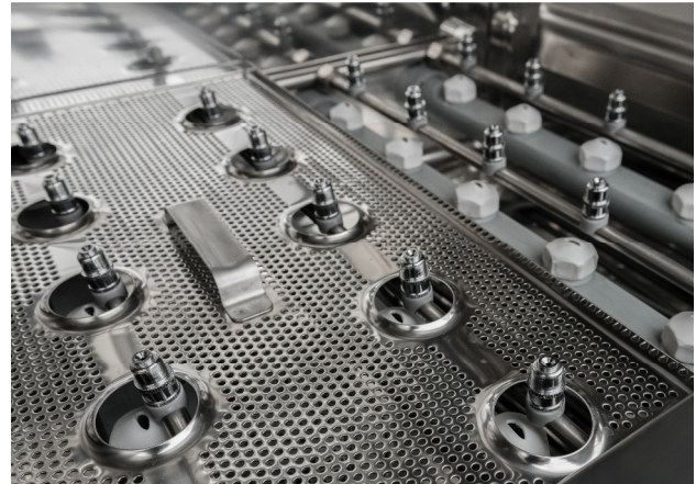
Unique wash and rinse system