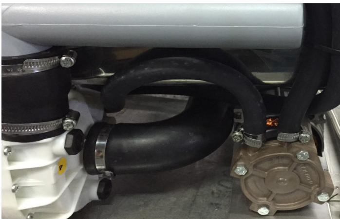
Powerful Wash Pump, 330 ltr./min of circulationin.